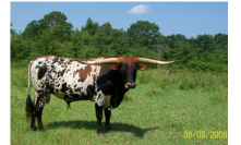
HORSESHOE J FOUNDATION