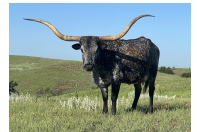
RIO BRAVO CHEX