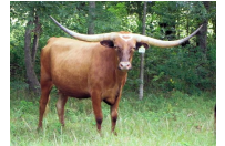
HUNTS MUTUAL RESPECT